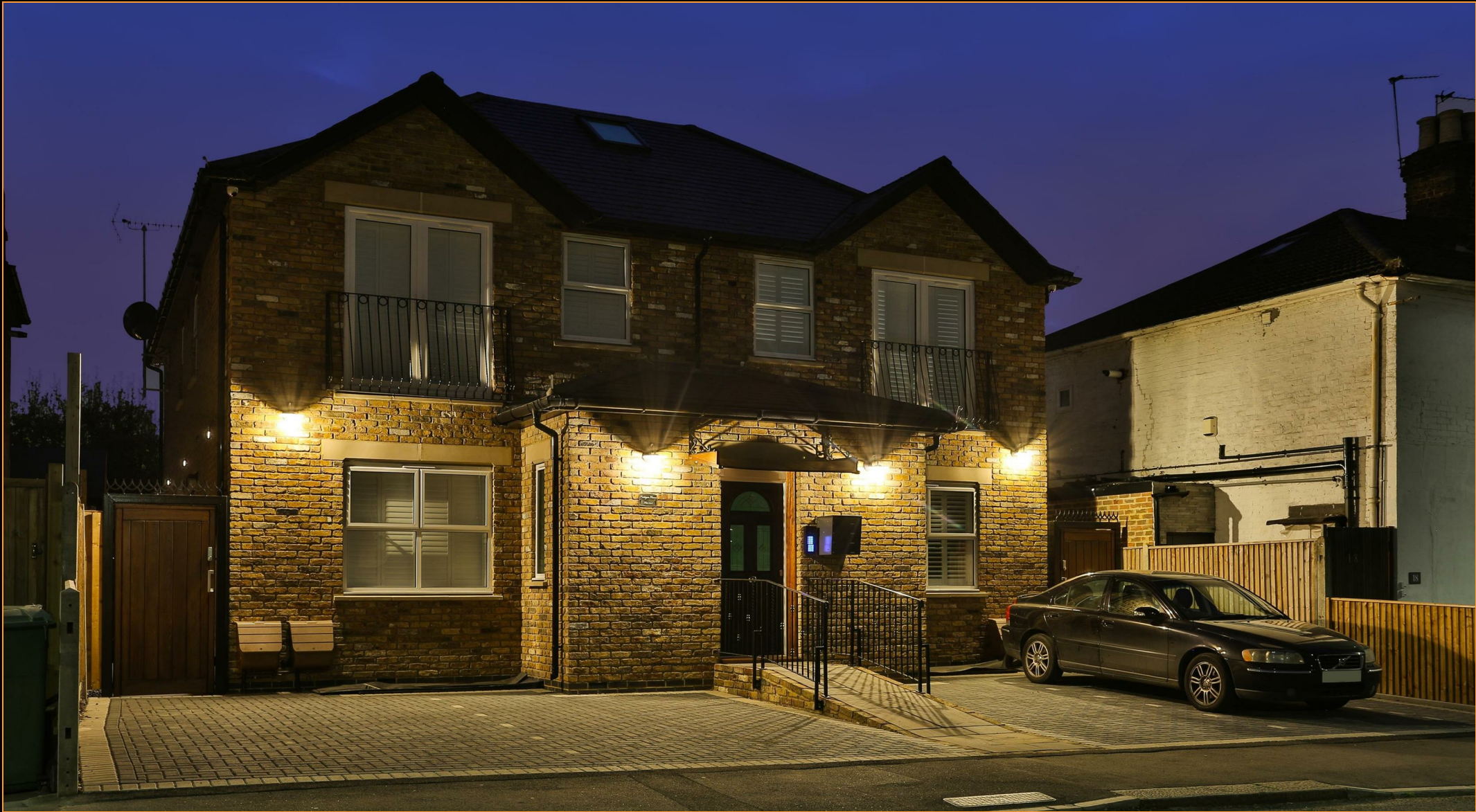
Flat 3 Pentagon House 16 Mill Lane, Carshalton, Surrey, SM5 2JY